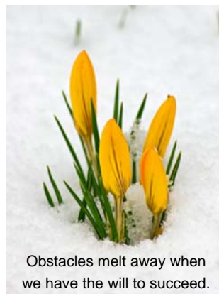
Obstacles melt away when we have the will to succeed.

StudentAid BC currently has a Loan Reduction Program for Home Support/Resident Care Attendant graduates, and a Loan Assistance Program for Early Childhood Education graduates. Call us for the website addresses.